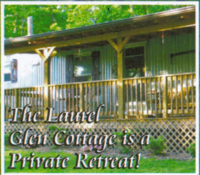
The Laurel Glen Cottage is a Private Retreat!