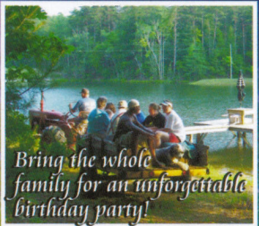
Bring the whole family for an unforgettable birthday party!