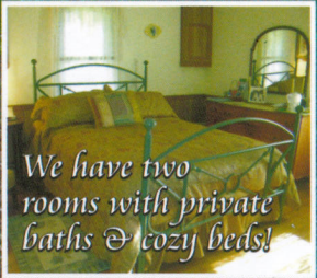
We have two rooms with private baths & cozy beds!