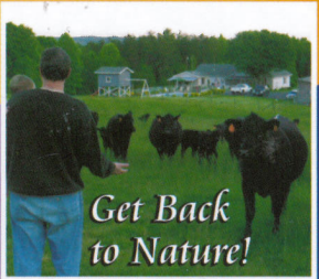
Get Back to Nature!